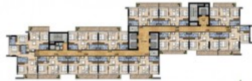
15 TH - 26 TH FLOOR