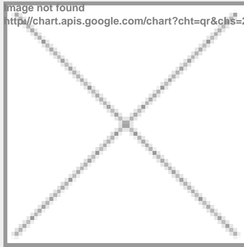
image not found http://chart.apis.google.com/chart?cht=qr&chs=250x250&chld=H|0&chl=https%3A%2F%2Fcapellaproperties.ae/property/shell-and-core-retail-space-for-f-and-b-utilities-with-mezzanine-level-in-a-prestigious-building-i-l-c-bsb-of-1216-02/

https://capellaproperties.ae/property/shell-and-core-retail-space-for-f-and-b-utilities-with-mezzanine-level-in-a-prestigious-building-i-l-c-bsb-of-1216-02/