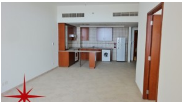
SAMSUNG WASHING CSC