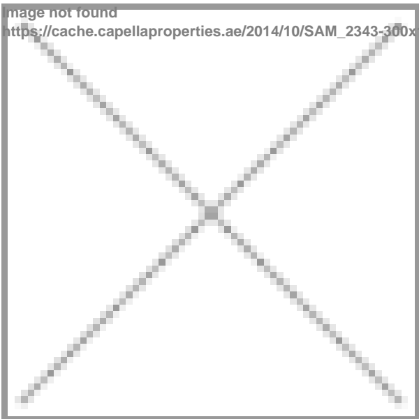
image not found https://cache.capellaproperties.ae/2014/10/SAM_2354-300x167.jpg

image not found https://cache.capellaproperties.ae/2014/10/SAM_2343-300x167.jpg