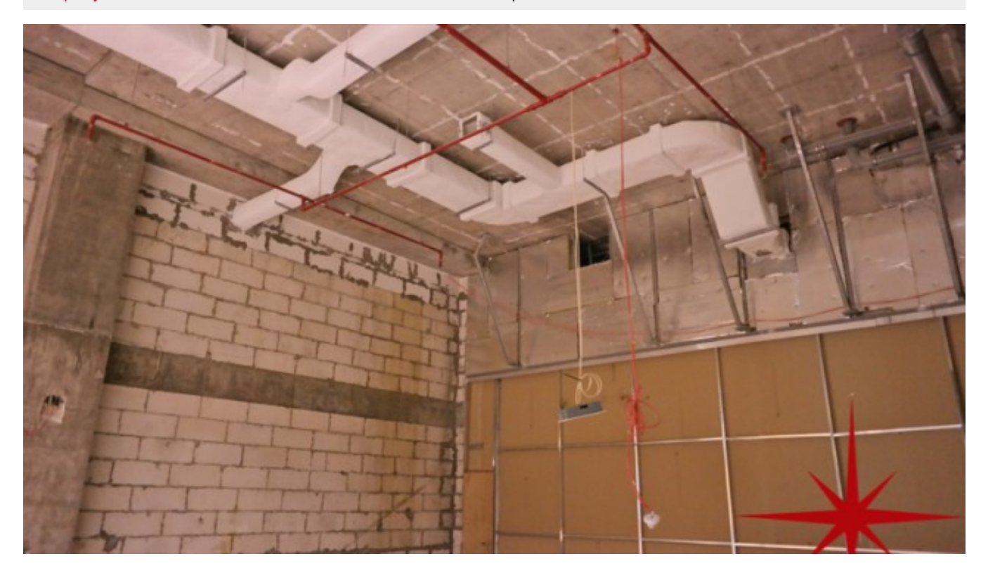
BUA 774Sq Ft, Fully Fitted, Retail or Office Space on the Ground Floor

Property is sold - ID: I-S-C-DIF-CP-0714-01 - DIFC DIFC - Shop/Showroom/Restaurant