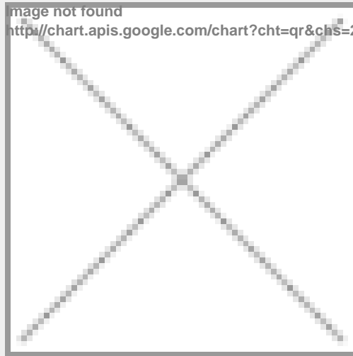
image not found http://chart.apis.google.com/chart?cht=qr&chs=250x250&chl=https%3A%2F%2Fcapellaproperties.ae/property/business-bay-shell-core-retail-outlet-with-mezzanine-floor-easy-access-and-high-roi-for-sale-i-s-c-bsb-of-0815-0/

https://capellaproperties.ae/property/business-bay-shell-core-retail-outlet-with-mezzanine-floor-easy-access-and-high-roi-for-sale-i-s-c-bsb-of-0815-0/